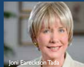
Joni Eareckson Tada