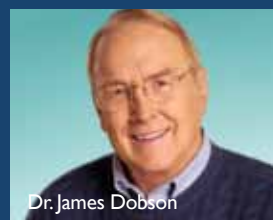
Dr. James Dobson